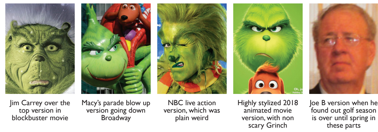
Jim Carrey over the top version in blockbuster movie Macy's parade blow up version going down Broadway NBC live action version, which was plain weird Highly stylized 2018 animated movie version, with non scary Grinch Joe B version when he found out golf season is over until spring in these parts

Pay for lunch, happy dollars, or just a good old donation. Keep the dream alive http://bit.ly/Rotaryfineshappydollars